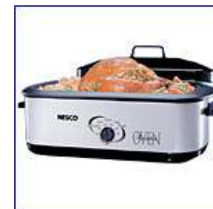
18 qt Roaster Oven St. Steel/Non-stick $85 St. Steel/St. Steel $120