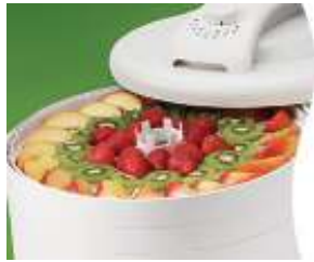
Gardenmaster 1000 W Entr'ee 8 trays/fruit roll/screens How to Dry Foods book Jerky spice pack $190 $165