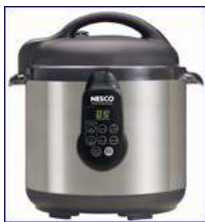
3 in 1 digital Elec Pressure Cooker $135 $128