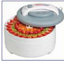
Snackmaster® Encore™ 500W 4 trays $69