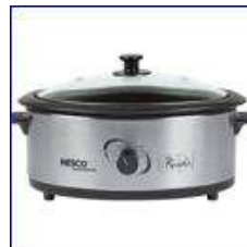
6 qt. Roaster Oven non-stick/glass lid $55