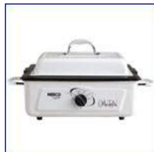
5 qt Roaster Oven non-stick $50