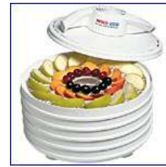
Snackmaster® 5 trays/Jerky spice pk $44 $39.75

Add-a-Tray (2 trays) Garden Master: $17 Encore: $13 Entree: $12